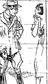
First of all—will you marry me?